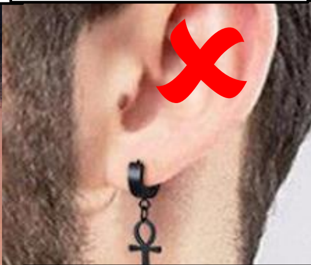
Not a stud