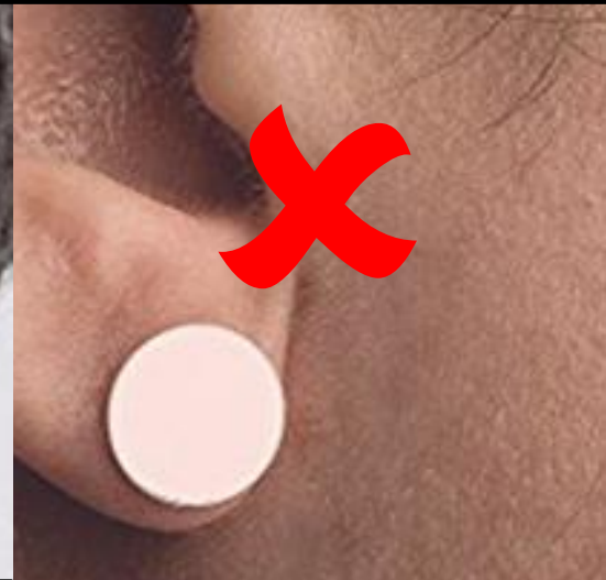
Not a stud, too large