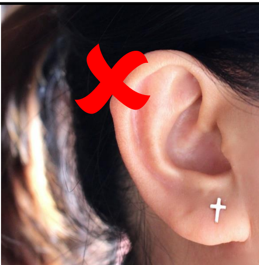
Not a round shape