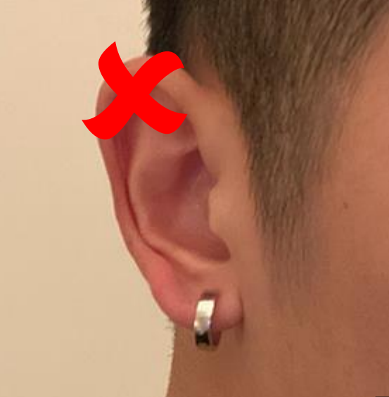
Not a stud