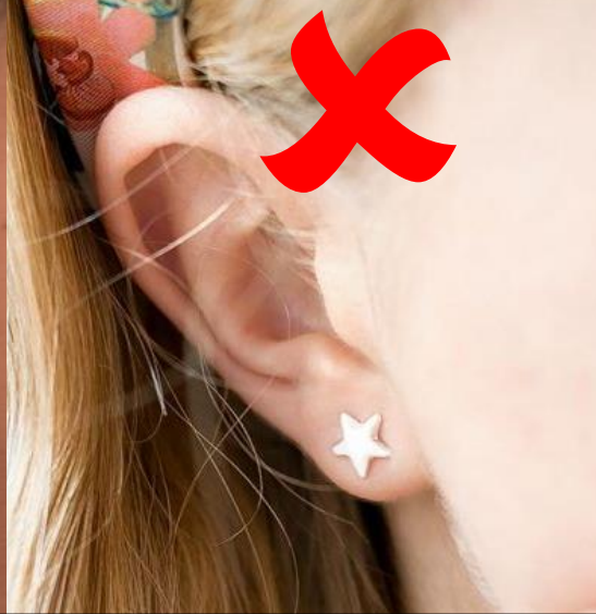
Not a round shape